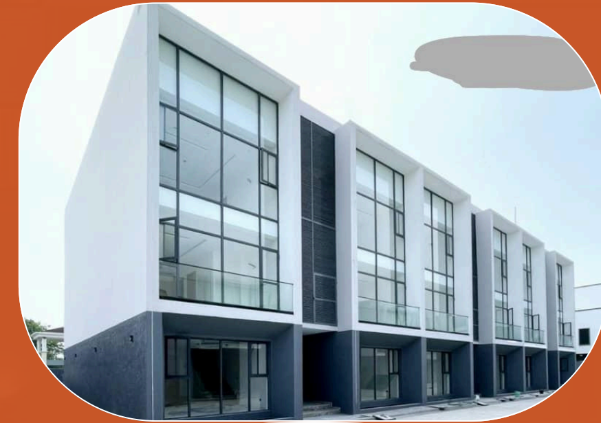
P55 COURT Banana Island