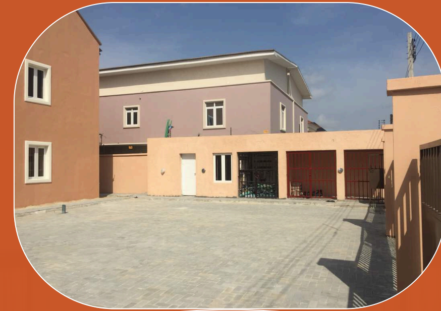
THE 1369 Apartments