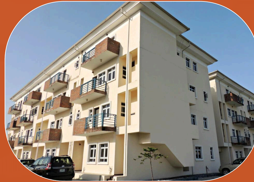
HEIRS PARK RESIDENCES Phases 1 & 2