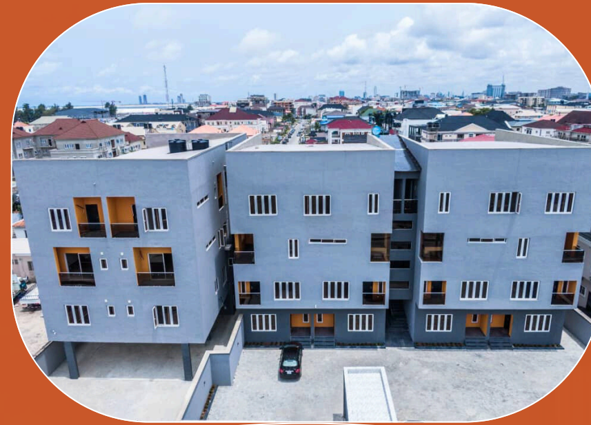
WALTON PARK Residences