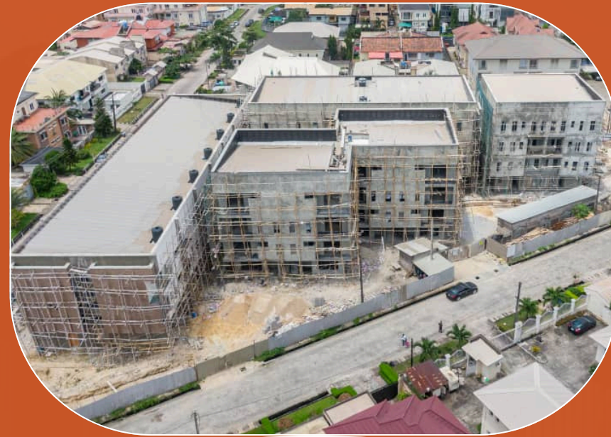
TUNBRIDGE WELLS Residences