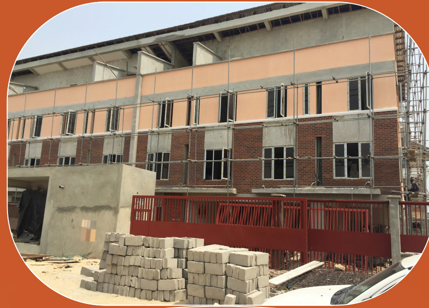
CORNAVIEV PREMIUM Apartments