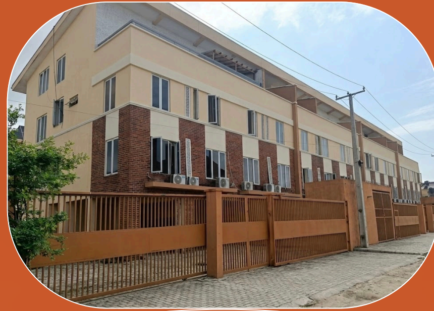
CORNAVIEV PREMIUM Apartments